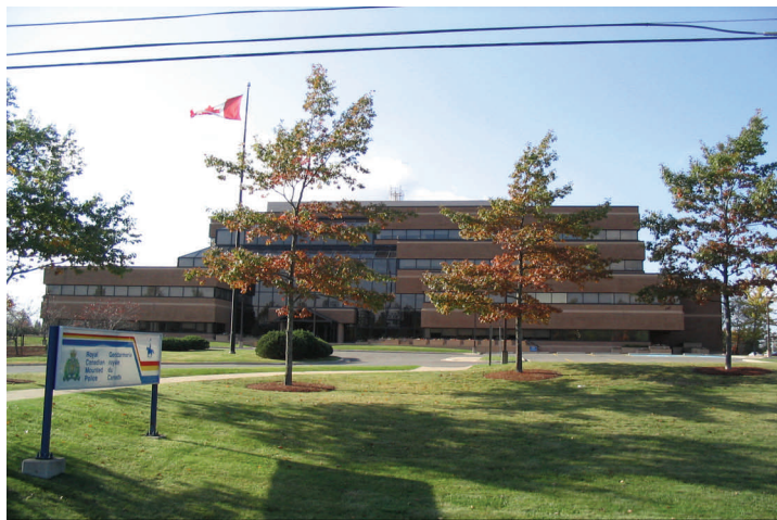
RCMP New Brunswick "J" Division Headquarters